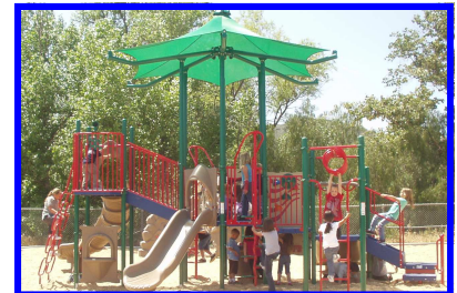
CHET F HARRITT SCHOOL