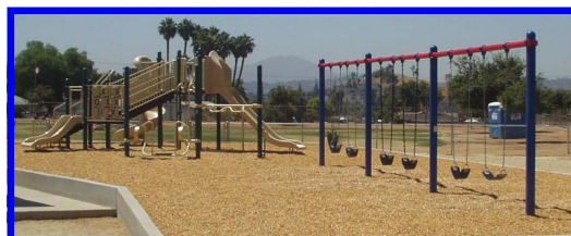
PEPPER DRIVE SCHOOL