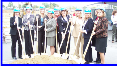
SUPERINTENDENT AND SCHOOL PRINCIPALS