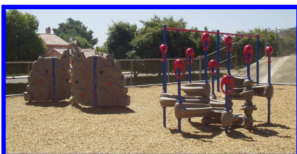
PROSPECT AVENUE SCHOOL