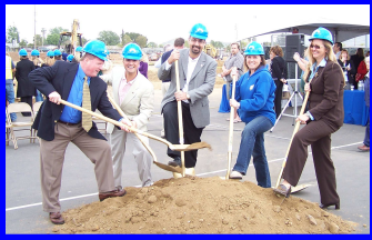
ICOC MEMBERS AND DISTRICT PERSONEL